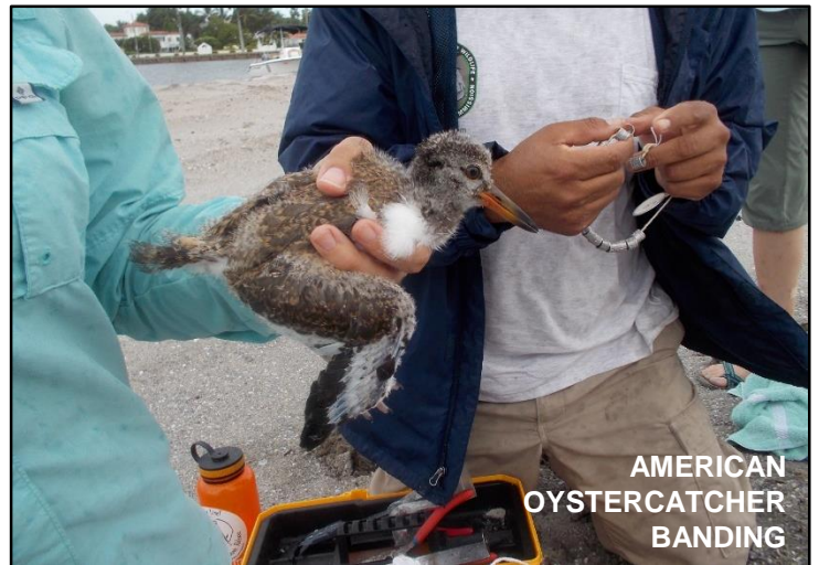
AMERICAN OYSTERCATCHER BANDING

Banding Oystercatcher Chicks: A team from the Florida Fish and Wildlife Conservation Commission along with ERM staff captured and banded two recently-hatched American oystercatcher chicks at the new Tarpon Cove project. The chicks were weighed and measured, and identification bands were placed on their legs. It is hoped that tracking these birds will help to understand their migration patterns and determine if they are residing in this area year-round.