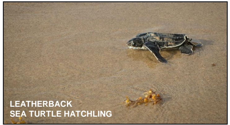
LEATHERBACK SEA TURTLE HATCHLING

Turtles: We are nearing the peak of sea turtle nesting season and numbers are promising! Current trends show that loggerhead nesting on some beaches is nearly double that of last year. Green sea turtles are also nesting in record numbers. Hatchlings have begun to emerge as well. Sea turtle nests take approximately two months to hatch and each nest contains about 100 eggs. It is estimated that as many as 2,000,000 hatchlings emerged on county beaches in 2018.