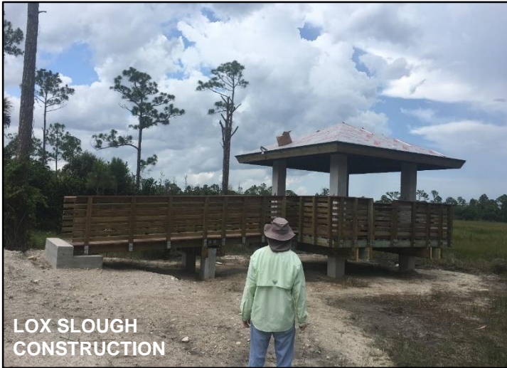
LOX SLOUGH CONSTRUCTION

Adopt-a-Natural Area: ERM welcomes two new adopters to our Adopt-a-Natural Area program: Fleet Feet of Delray Beach and Busch Wildlife Sanctuary. Fleet Feet will be hosting running events at Yamato Scrub Natural Area and Busch Wildlife will be using the natural areas to release rehabilitated native animals and give educational talks. Welcome aboard, Adopters!