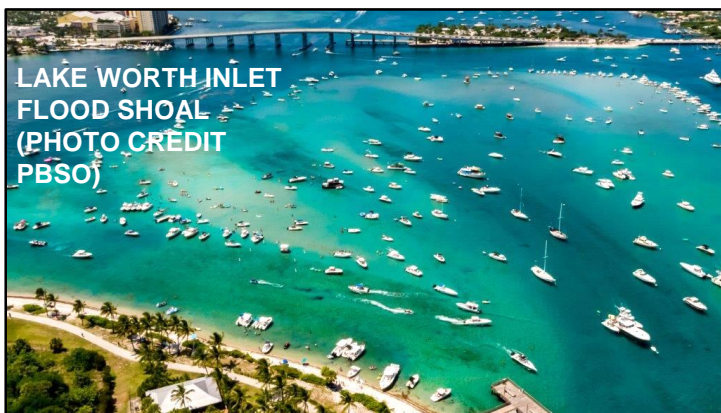
LAKE WORTH INLET FLOOD SHOAL

ERM has partnered with the Marine Industries Association of Palm Beach County to investigate the flood shoal north of Peanut Island. Over the years, the accretion of sand has created both environmental and navigational concerns. The goals of the project are to reduce sedimentation at the Phil Foster Park Snorkel Trail, increase areas of recreational boat use, and improve navigation and safety by providing easier access for first responders. ERM staff completed the first phase of the project feasibility study by conducting seagrass surveys and working with engineers to develop a sound project design. A public outreach meeting will be held at the Palm Beach Marriot Singer Island Resort & Spa on August 27 th from 5:30 to 8:00 pm.