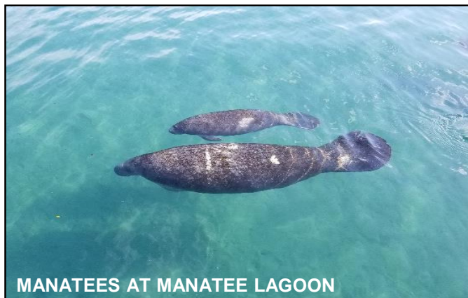
MANATEES AT MANATEE LAGOON

While sea turtle nesting season officially starts on March 1 st , the first leatherback sea turtle nest in the state was found a bit early on February 26 th in Palm Beach County. Leatherbacks are the first species to nest each season and they are the rarest of the three regularly-nesting species. Last year there were 949 leatherback nests in Florida and 305 of these were in Palm Beach County.