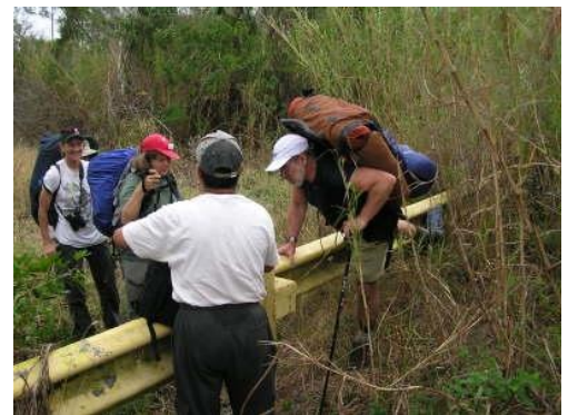
Current access into DuPuis Wildlife & Environmental Area for through hikers on the Ocean to Lake Trail