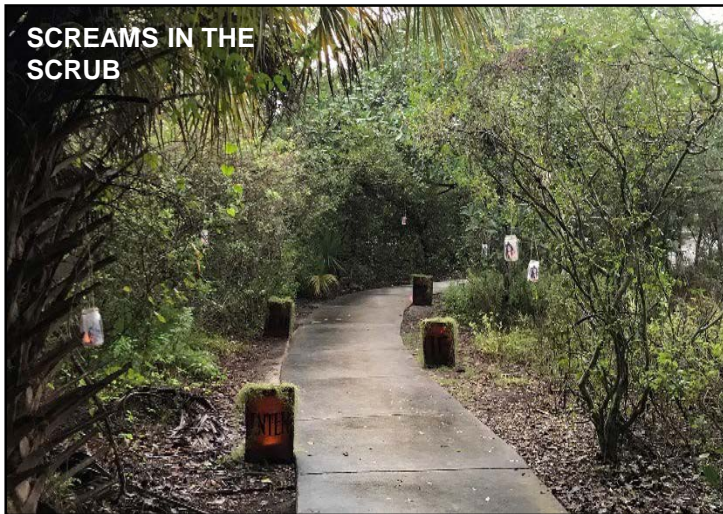
SCREAMS IN THE SCRUB

Screams in the Scrub Trail Run: ERM teamed up with our Adopt a Natural Area partner, Fleet Feet, to host a three-mile trail run at Yamato Scrub Natural Area. Even though it was a rainy day, 60 runners participated in an evening of Halloween fun. The run took participants through a variety of natural habitats.