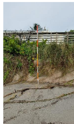
Hurricane Dorian caused dune erosion in front of the Jupiter Civic Center. (September 2019).