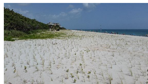
Newly planted sea oats and newly constructed beach 2014/15 renourishment (August 2015).