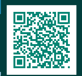
SCAN WITH SMARTPHONE

Additional information is available for viewing on the Roadway Production webpage at: www.pbcgov.com/engineering/roadwayproduction