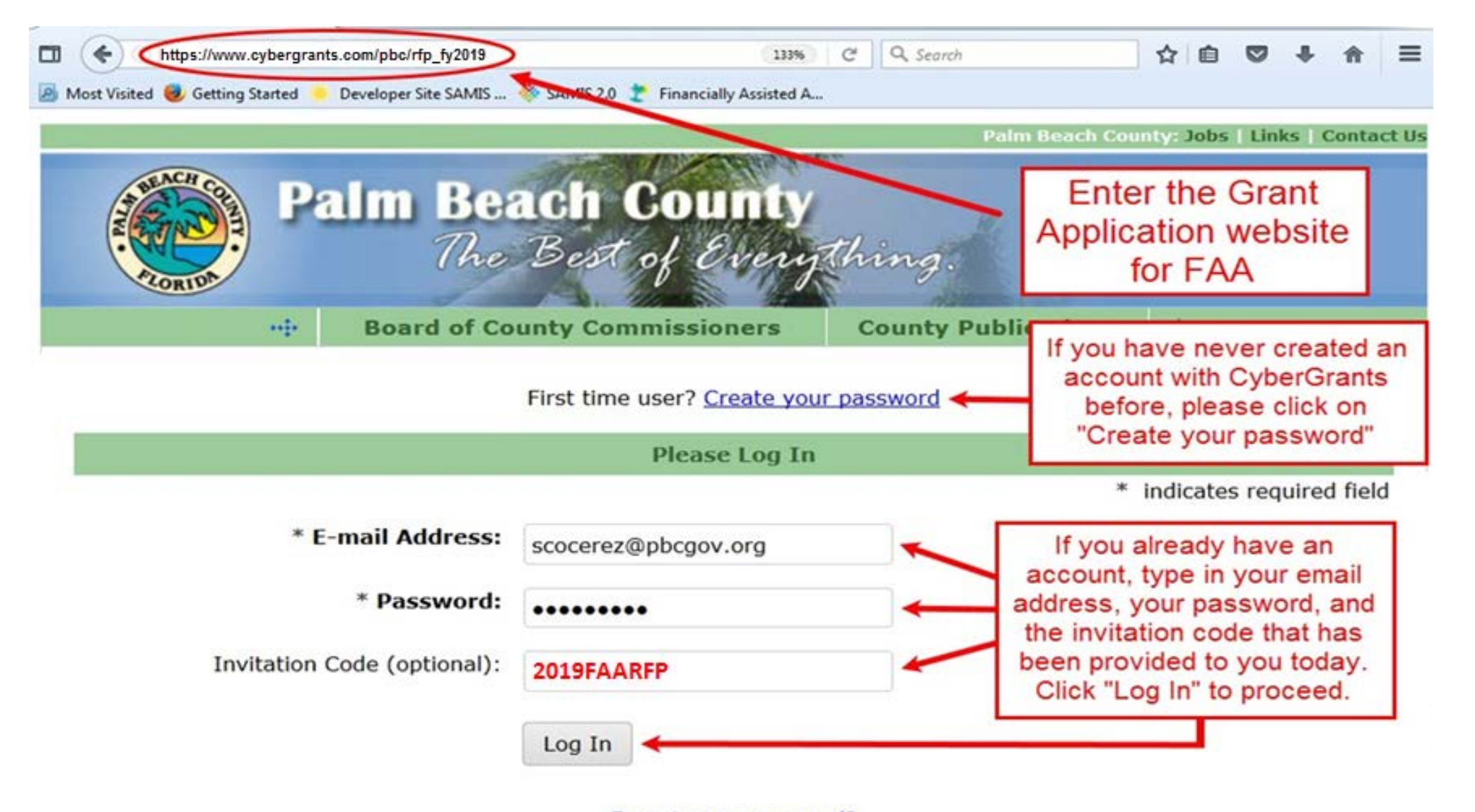
Forgot your password?

Please note that you must have cookies and JavaScript enabled on your browser in order to successfully log in.