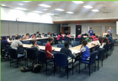
Teenagers from across Palm Beach County learn the value of a dollar at the 4-H "On My Own" workshop.

Thirty teenagers from across Palm Beach County learned the value of a dollar and much more during the October 4-H "On My Own" workshop. Middle and high school youth gained valuable skills and knowledge in writing checks, creating a savings account, understanding payroll deductions and managing a monthly budget through fun hands on activities. The highlight of the day was the "On My Own" simulation in which youth assumed a family situation ranging from single to married with four children. They pretended to live through a month using their monthly salaries to purchase all of their family's needs and wants. Along the way they discovered many challenges and solutions in