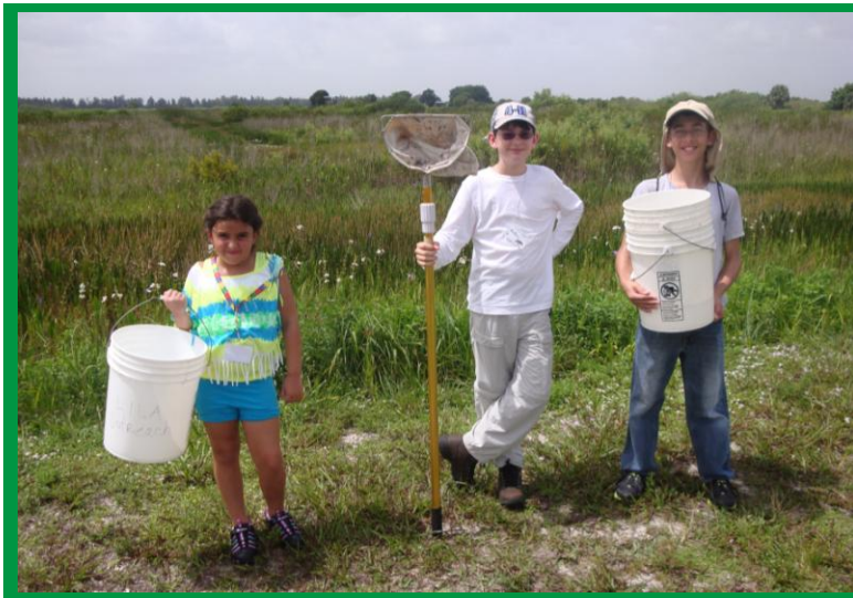
4-H Nature Camp at Arthur Marshall Wildlife Refuge