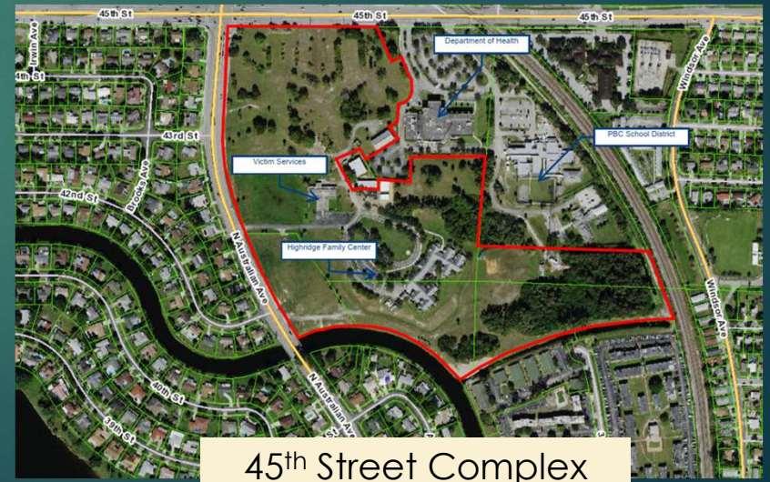
45 th Street Complex